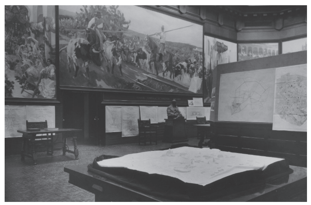
Exhibition of the Project "Ciudad Universitaria de Madrid". Sorolla Room, Hispanic Society of America, 1928.

While this was happening in the United States, an authoritarian regime, led by General Primo de Rivera, had been in place in Spain since 1923, and the position of the monarchy was being questioned by political and intellectual circles. The friendship and respect he professed for the king led Huntington to expressly support two of Alfonso XIII's most important cultural initiatives: