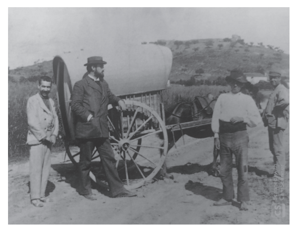
Figure 2. Huntington in Spain, 1892.

Archer Huntington, the only son of one of the richest men in America, Collis Potter Huntington -builder of the Central Pacific Railroad and the Newsport News Shipbuilding and Drydock Company-, had already concluded at the age of twenty that he had little interest in the family business, so he dedicated his life to Hispanic Studies and to his project of a Spanish Museum instead. The influence of his devoted mother, Arabella, was decisive on developing his artistic interests.