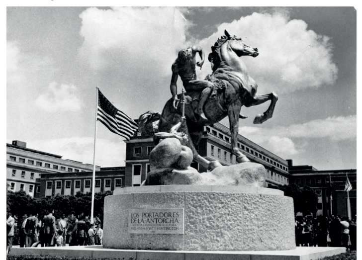
Los portadores de la Antorcha by Anna Hyatt. Ciudad Universitaria de Madrid, 1955.

Huntington had been an unofficial ambassador for years, dedicated to strengthening ties between the two countries. If the non-presence of foreign ambassadors in Spain had been one of the most obvious evidence of his international isolationism, to evoke the stamp of an ambassador referring to Huntington was to grant him publicity and express recognition by the highest representative of US diplomacy of having been a valuable link between the two countries.