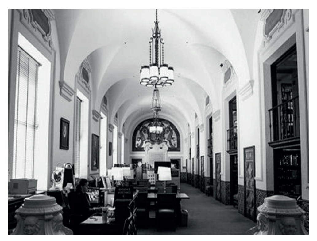
Hispanic Reading Room, Library of Congress, Washington